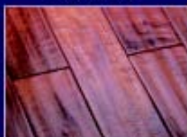
Acacia Mangium Merlot