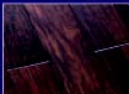
Tropical Walnut Darjeeling